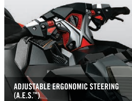
ADJUSTABLE ERGONOMIC STEERING (A.E.S.™)