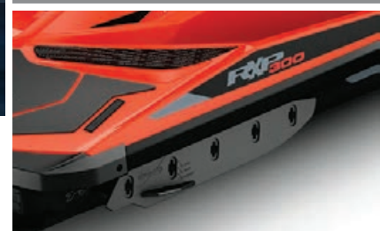
ADJUSTABLE REAR SPONSONS