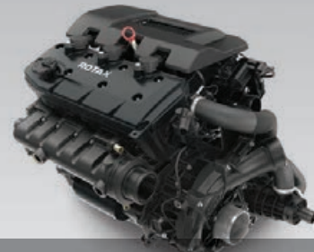
ROTAX 1630 ACE ENGINE

Type..... Rotax 1630 ACE engine Intake system..... Supercharged with external intercooler Displacement..... 1,630 cc Cooling..... Closed-Loop Cooling System (CLCS) Reverse system ..... Electronic iBR ® Starter..... Electric Fuel type ..... 87 octane – minimum 91 octane – recommended