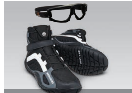
RIDING BOOTS AND GOGGLES (OPTION)