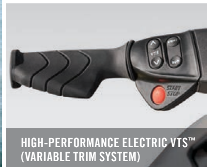
HIGH-PERFORMANCE ELECTRIC VTS™ (VARIABLE TRIM SYSTEM)