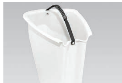
FRONT STORAGE TRAY (OPTION)