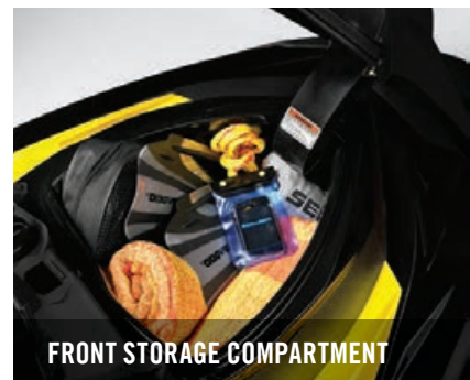
FRONT STORAGE COMPARTMENT