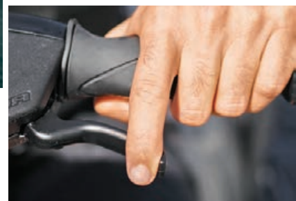
iBR (INTELLIGENT BRAKE & REVERSE)