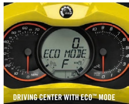
DRIVING CENTER WITH ECO™ MODE